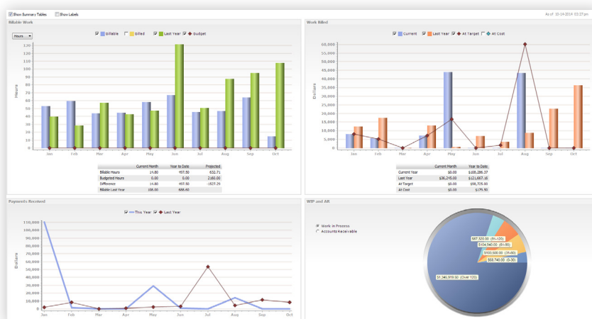
My Performance Dashboard - Visual reference of your performance as a Working Attorney

"We are thrilled to announce the release of Version 4.6 which enhances the Orion experience with significant updated features and useful add-on software options. Many of our competitors tend to charge their customers for enhancements along with a version change, but Orion strives to provide many improvements at no added cost for maintenance customers using the current version."